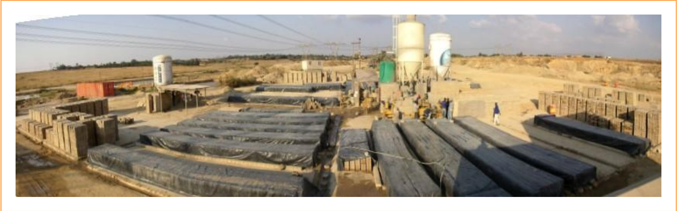
HYDRAFORM Block Yard teams with Joseph Semenkane the block yard manager

HYDRAFORM's operates its own block yard in Johannesburg, South Africa. The block yard, which began as a training facility in 1999, has grown to a full-scale industrial block yard with an annual block production capacity of over 2 million.