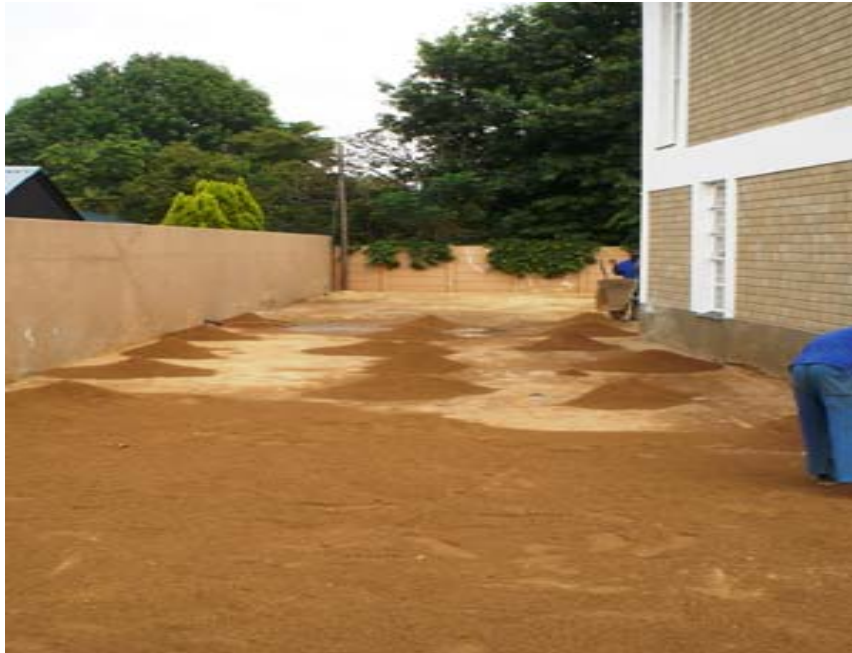
Figure 5: Stockpiling the bedding sand