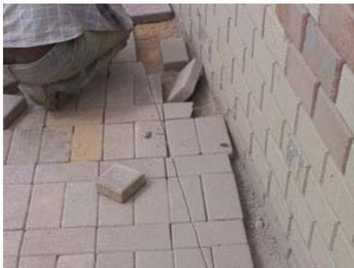
Figure 6a 6

Block cutting for the filling of areas next to edges will require you to measure the gap and mark the block so that it can be cut with an angle grinder or an industrial guillotine and then the gap filled in (Figures 6a & b). As much as possible, avoid the use of concrete infilling. Where this is unavoidable, make sure that the concrete is of a higher strength than the paving units.