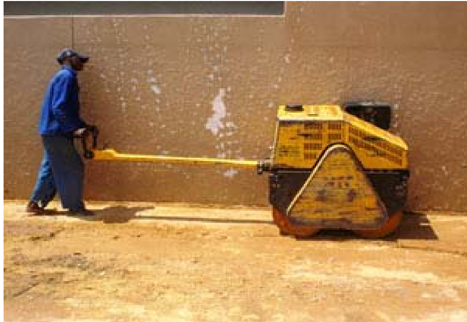
Figure 4: Compaction

Once the surface has been graded to the correct level and slope you can then proceed with the compaction of the sub-base using a suitable vibrating compactor. With the larger type of compactor, only one pass will be necessary. Whereas with the smaller, plate type, compactor two passes will be required.