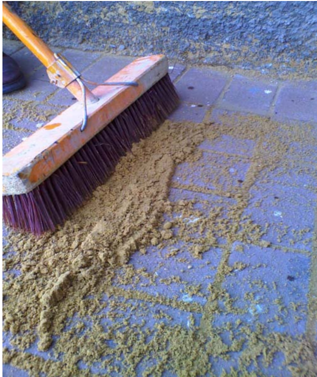
Figure 7: Filling in the joints

Figure 1 is an extract from the CONCRETE MAUFACTURERS ASSOCIATIONS' "CONCRETE BLOCK PAVING – BOOK 4"